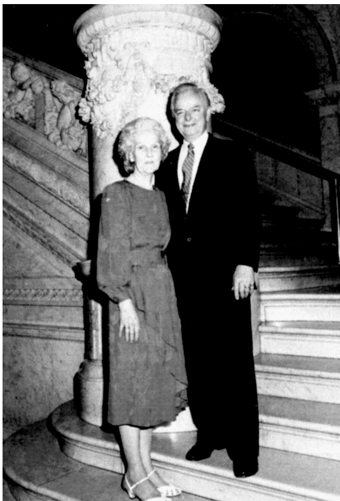
Robert C. Byrd November 20, 1917–June 28, 2010